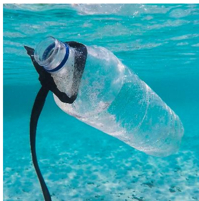
We launched our unique Redesigning Plastics Initiative