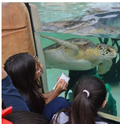
Our hosted projects contribute to many sectors of ocean conservation