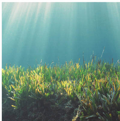
SeaGrass Grow held its first workshops Jobos Bay, Puerto Rico